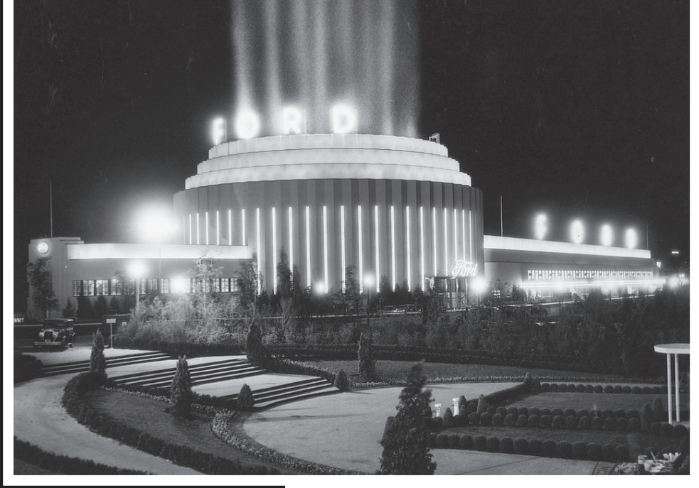
The Ford building at the Chicago World's Fair

The 1933 Chicago World's Fair was so successful that President Roosevelt encouraged the Dawes brothers to reopen the Fair in 1934. They did, and by the time it closed nearly forty million people had visited the Century of Progress Exposition.