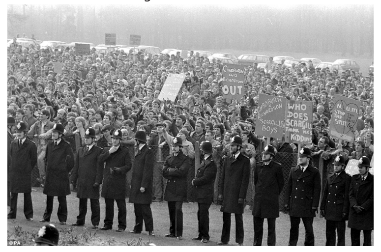
A Colliery protest

As the strike went underway, it was nearly universally observed in South Wales, Kent, Yorkshire, Scotland, and Northeast England. Instead of heading to the mines for work, miners and their families would hold protests outside of the mine entrances, wearing red carnations as a symbol of solidarity. They would hold picket signs in support of the union and their fellow community members, and chants would break out among the crowds.