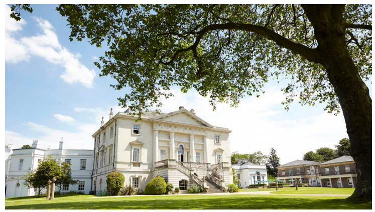
The Royal Ballet School's White Lodge

In Billy Elliot The Musical , the crux of young Billy's future hangs on whether or not he auditions for The Royal Ballet School and, if he is does audition, whether or not he is accepted into the prestigious school for classical ballet. Attending The Royal Ballet School would be a complete departure from the life Billy knows in his mining town in Northern England and would require moving to a new part of the country, living in a boardinghouse away from his family, and embarking on a strict academic and dance training regimen that could last up to 8 years.